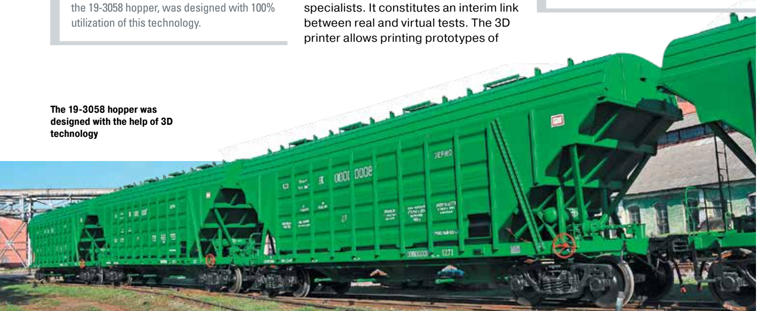
The 19-3058 hopper was designed with the help of 3D technology

— If earlier some components required process preparation of the production and manufacturing of equipment, with each iteration involving additional adjustment of equipment and costs, today we can immediately print everything on the 3D printer. Even if we are wrong, we only incur printing expenses. These expenditures are by far smaller than those related to the manufacturing of a new component, both in terms of time and money.