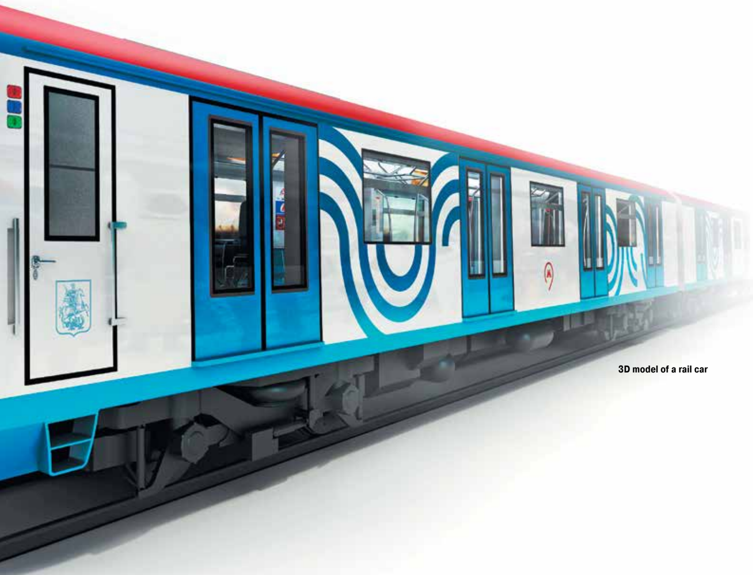
3D model of a rail car

D esign centers that started to implement these technologies existed mainly at Tver Carriage Works and Demikhovskiy Engineering Plant. At the time, there were only a few 3D drafting software applications on the market. They somewhat differed from each other, as some were tailored for designing objects with complex shapes or could create parametrical drafts; others had simple modeling functions but allowed creating objects