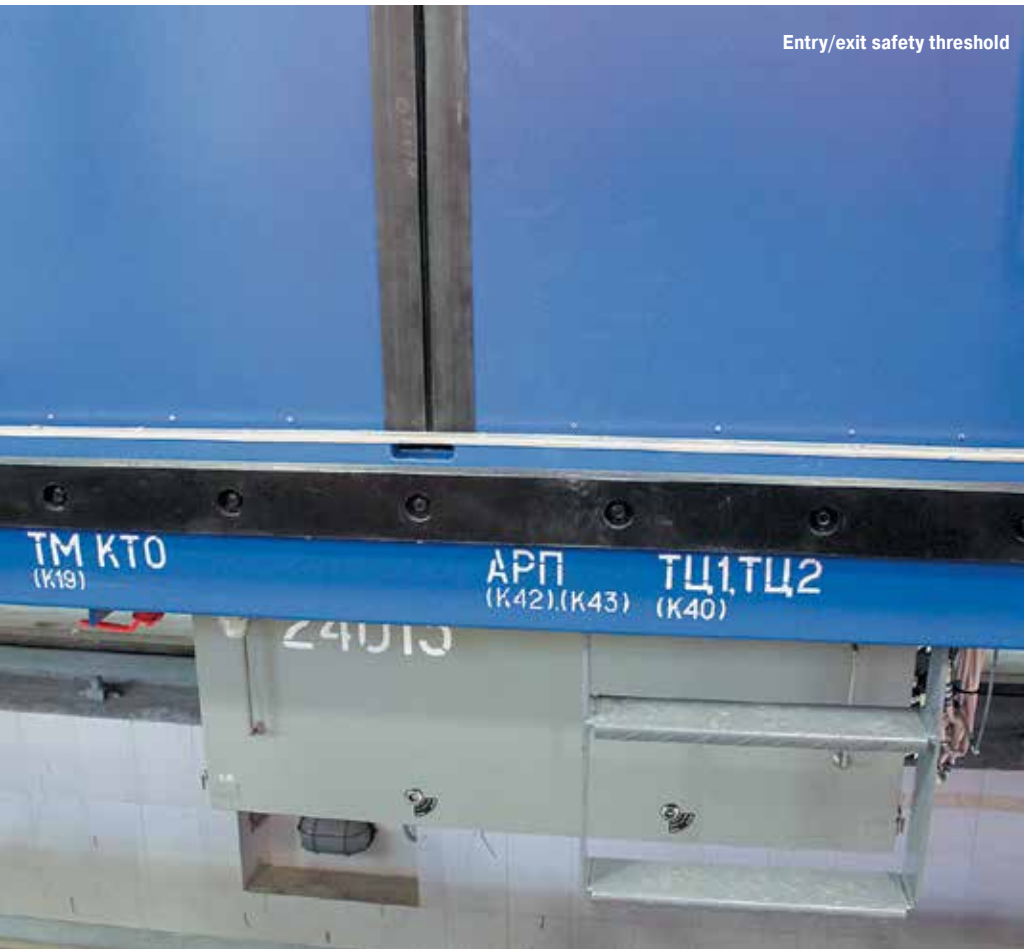
Entry/exit safety threshold

DEVELOPERS PUT A SPECIAL FOCUS ON THE DURABILITY AND RELIABILITY OF CARS. FOR EXAMPLE, THE "ANNIVERSARY" CARS HAVE ALL-METAL BODIES MADE FROM WELDED STRUCTURE WITH LOAD-CARRYING STAINLESS-STEEL OUTER SKIN