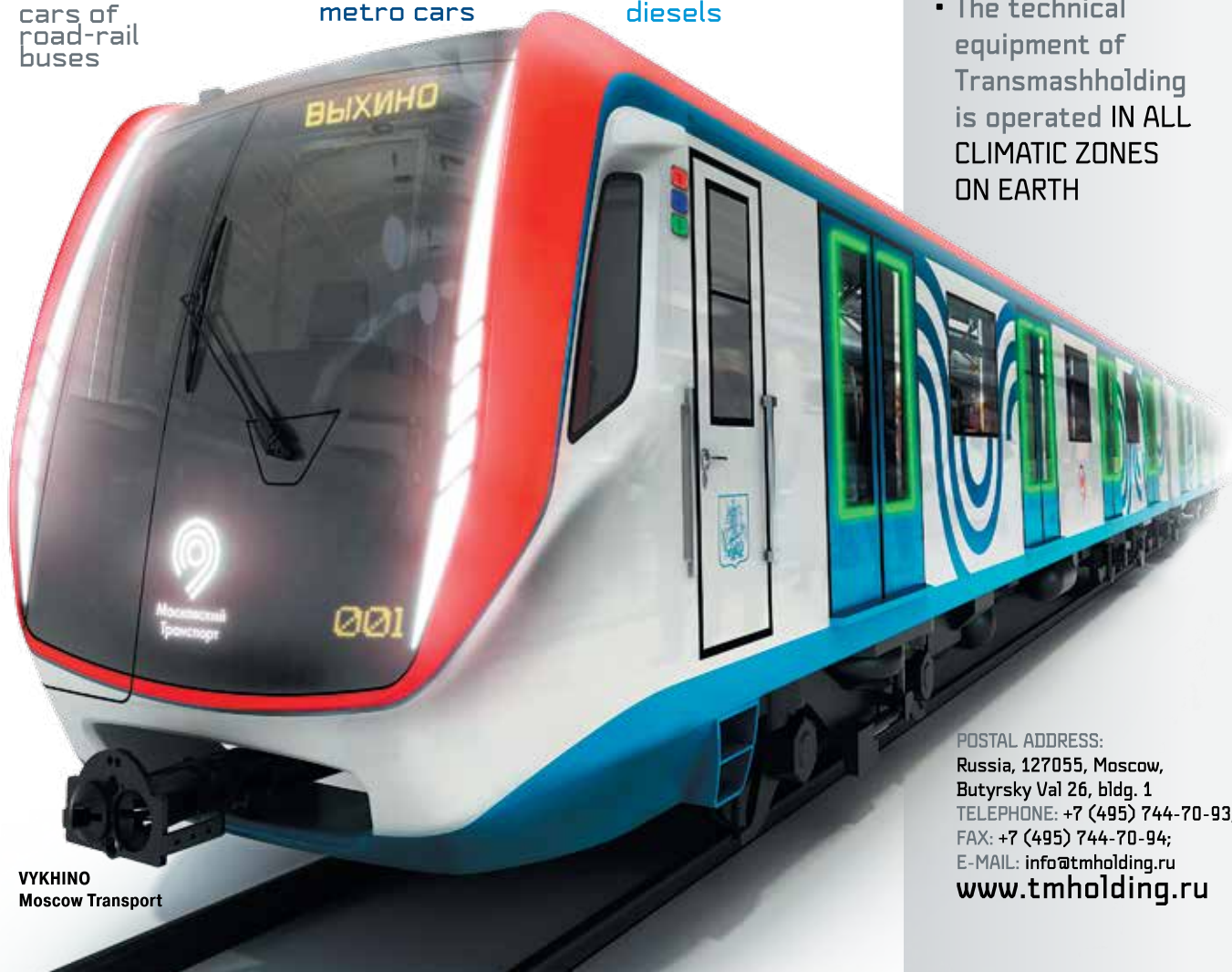
VYKHINO Moscow Transport