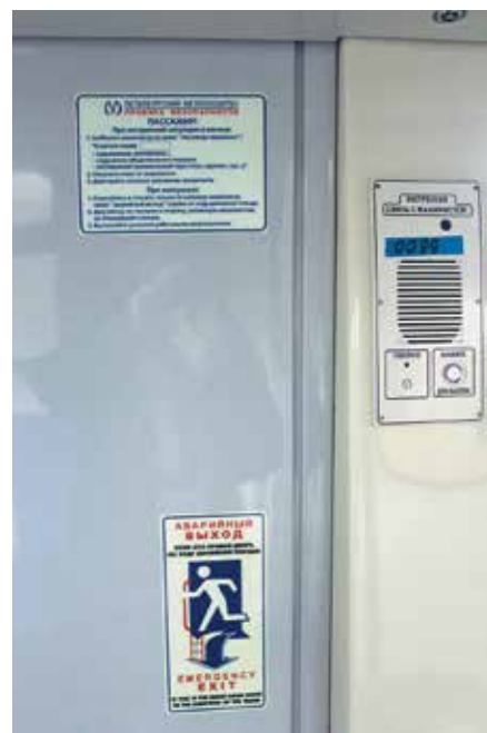
Emergency talkback between driver and passenger

The “Anniversary” cars can be used in tunnels and open space areas alike. This