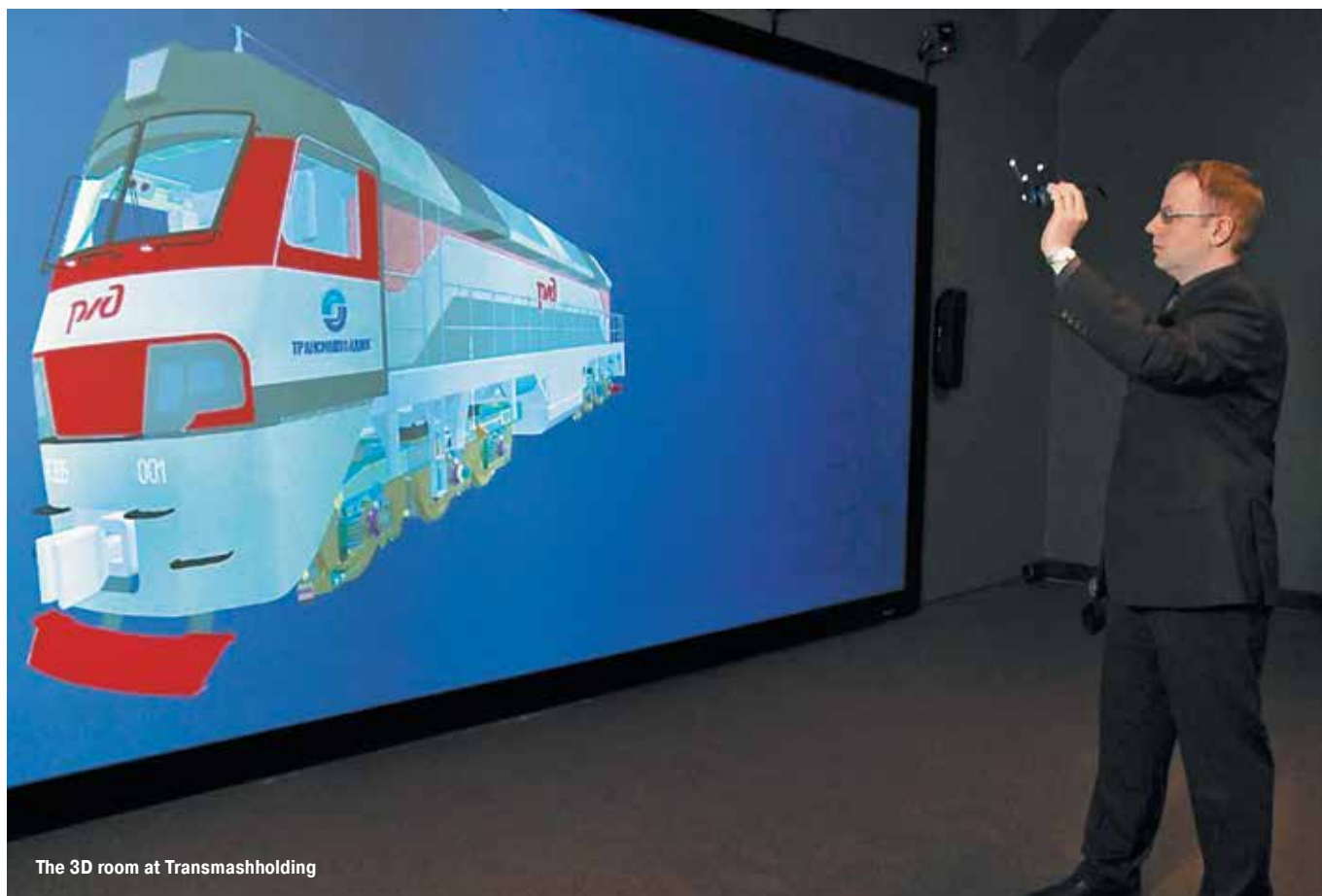
The 3D room at Transmashholding

The 3D room allows visualization of drafted objects and analysis of the quality of the design. As for potential customers, it ensures the greatest effect of presence and the possibility of demonstrating or modifying the item at earlier stages.