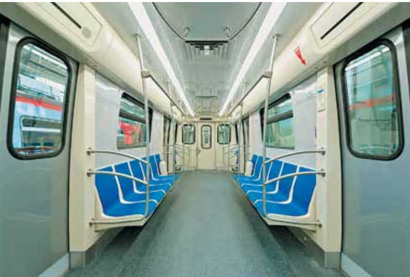
Car's passenger compartment