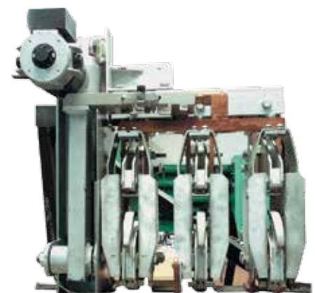
R-45-03 remotely controlled circuit breaker with the ATL20 screw-gear motor

The 4ES5K No. 001-003 electric locomotives with axle-by-axle control have been in operation since last January. Locomotives circulate amid the most challenging natural landscape