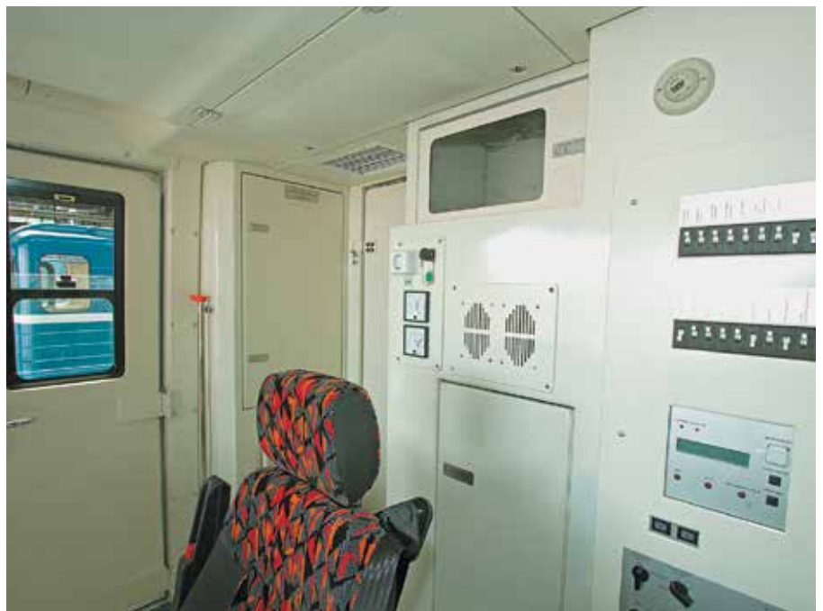
Control room with auxiliary car and train- safety control unit and panels

The "Anniversary" cars will add to the beauty of the Saint Petersburg Metro and it will not be long before its citizens will pay tribute to their comfort level and high quality. 🌀