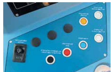
Car equipment control panel