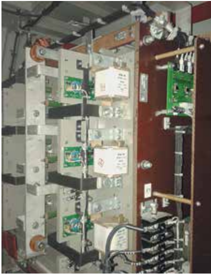
Power unit (PU). Lateral view

Independent excitation of traction motors (TEMs): now in traction as well as in recuperation mode.