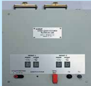
Diagnostic unit (DU) which controls the condition of silicon-controlled rectifiers of arms of the power unit (PU), transistors of power supply units (PSUs) and controls units (CUs)