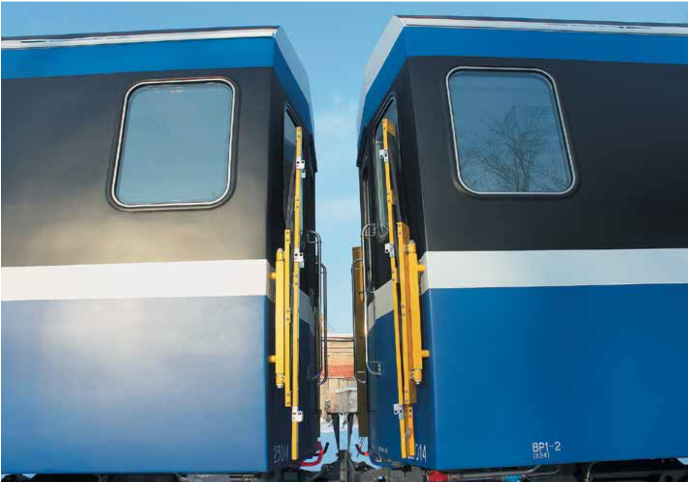
Intercar safety gear