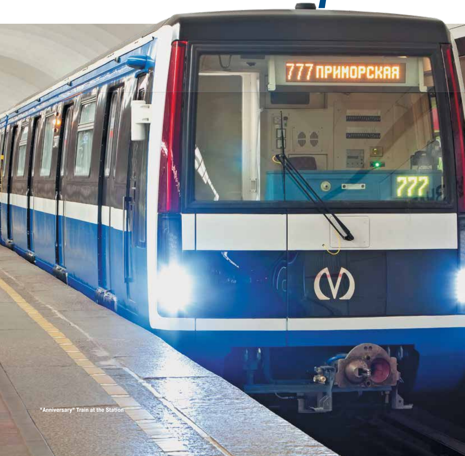
“Anniversary” Train at the Station